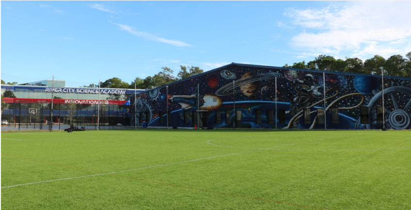
RCSA Innovation – New Campus

Jacksonville, Florida | $79,210,000 Series 2020, Series 2021 & Series 2022 Bonds