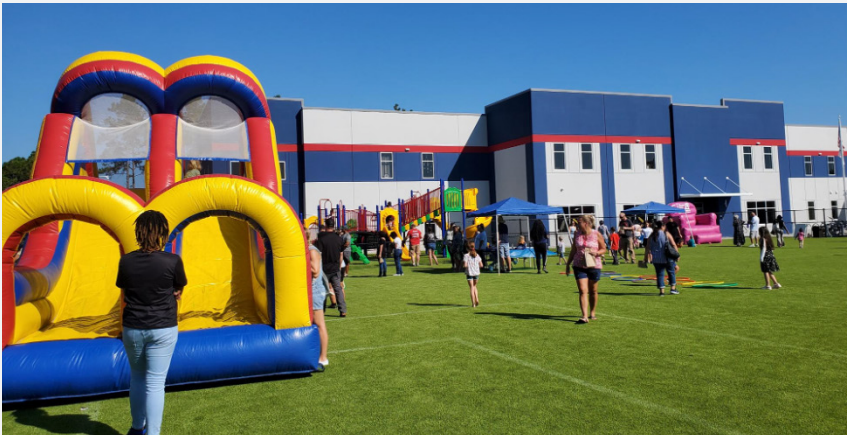
RCSA Intracoastal – Opened Fall 2020