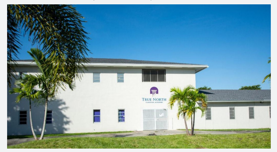
True North Classical Academy at Gateway Campus